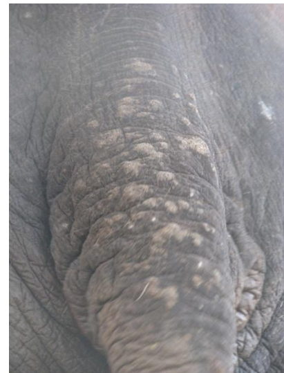
Figures 3a and b: Skin related problems observed elephants associated with mutts