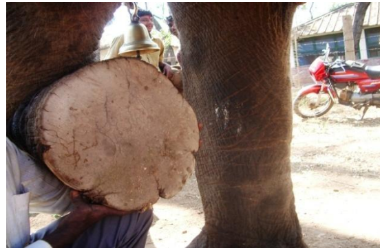
Figures 2a and b: Comparison of elephant pads across different regimes as examples to indicate natural pad

Dr. Kallappa, who has had experience in treating this category of elephants, had consistently noticed skin related issues (Figures 3a and b) that were absent in forest camp or wild elephants. The condition was called Warts, which may be due to malnutrition.